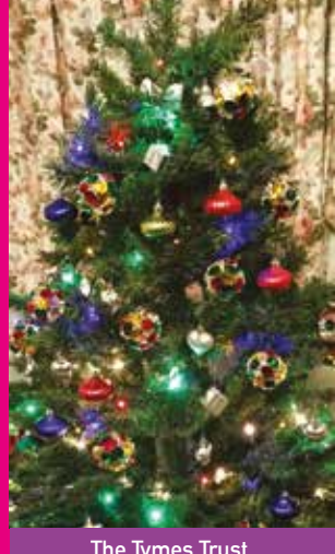
The Tymes Trust Christmas Tree