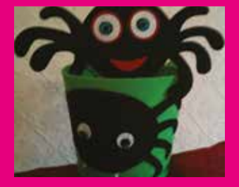
Seb says: I was going to keep my bucket for Summertime — but I've used it for most of the year to sit in and think. I am a Great Thinker. What about you? Can you draw me a picture of your favourite cuddly toy? Post it to Seb at the address below or you can take a photo — we'll tell you

where to email it. Let us know when it's ready (email me on the Contact Us form at www.tymestrust.org) and I'll send prizes for every picture I get, till I run out!