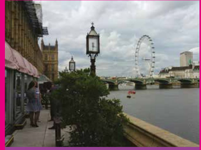
In June we held our Awards Ceremony at the House of Lords with Nisai Learning.