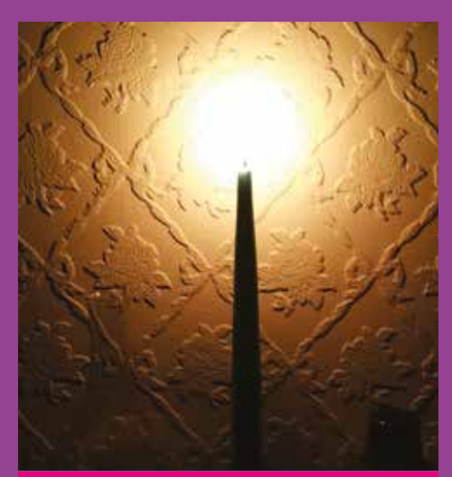
Light a candle for the children with ME For the children need remembering you see It's a devastating illness So just take a moment's stillness To resolve we'll do our best to set them free.